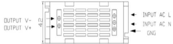
Product model: LTT35W