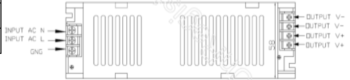
Product model: L150W